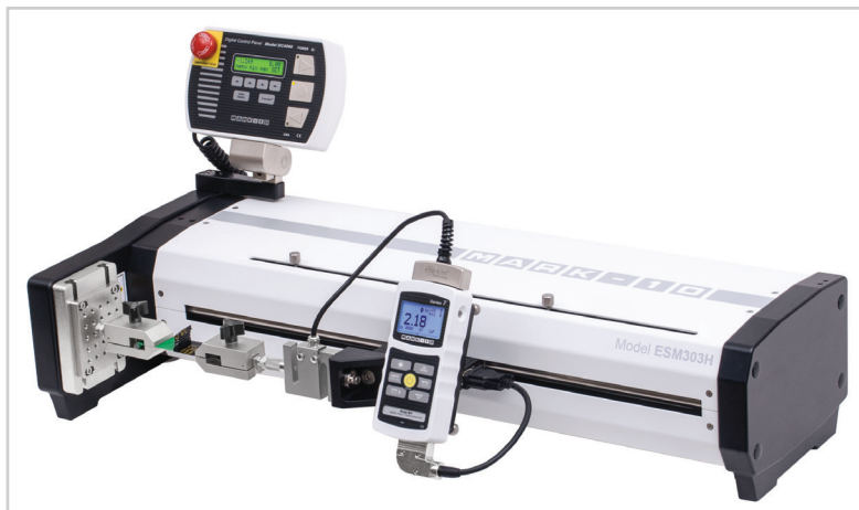
ESM303H is shown above configured for a peel test, with a Model M7i indicator, Series R01 load cell, and G1008 film and paper grips.

The ESM303H is a highly configurable horizontal force tester for tension and compression measurement applications up to 300 lbf [1.5 kN], with a rugged design suitable for laboratory and production environments. Sample setup and fine positioning are a breeze with available FollowMe™ force-based positioning - using your hand as your guide, push and pull on the load cell to move the crosshead at a variable rate of speed.